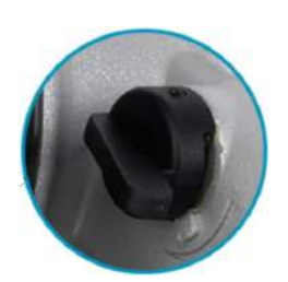
Speed adjustment knob